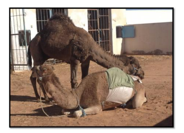
Figure 4. An example of how to protect the dam's back during a semen collection session.

Mating behavior could be recorded by a "Focal animal sampling". In this case it is useful, the mating time may be divided into three parts according to the different states that the male could show: copulation/service time, standing over/near the female time, walking around time. Moreover, to standardize the procedure, the sample session may be scheduled at a predetermined time, before starting: a maximal latency time (from when the male is free to the first mating attempt) of 15 minutes, a maximal mating time of 45 minutes, a maximal time between two copulations of 30 minutes, maximal standing over the female of 20 minutes and as previously mentioned, with maximal three refuses to approach the female. Finally, it is important to note down the frequency of the following events: mounting attempts, number of mounts, blatering, defecation, dulaa extrusion, flehmen, jumping, neck-touching, sniffing, sound emission, tail flapping, teeth-grinding and vawning.