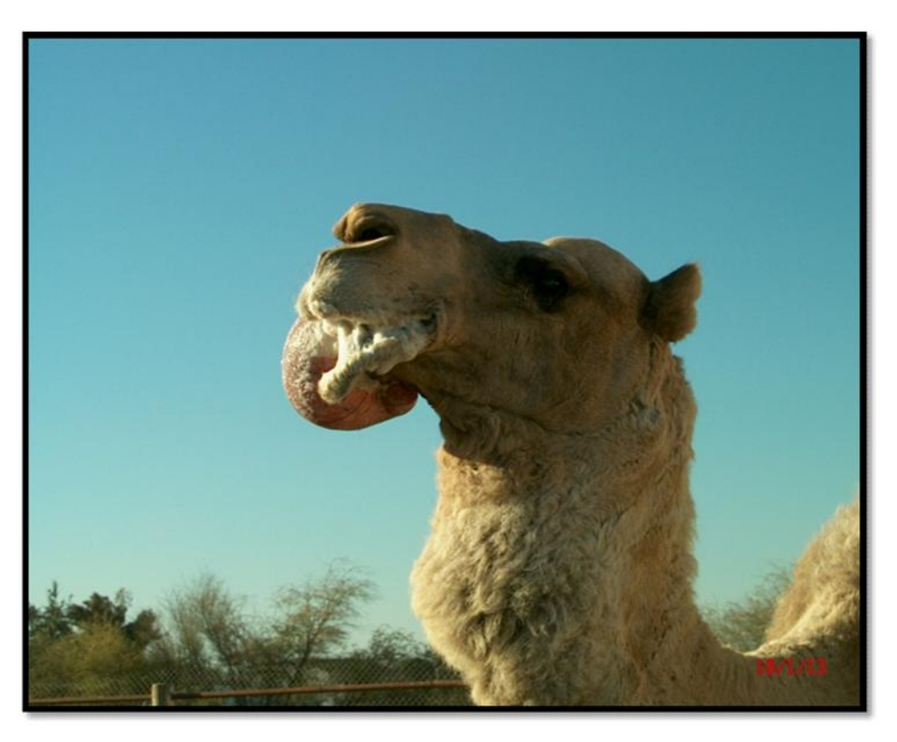
Figure 2. Male dromedary camel extruding his "dulaa" after mating.

Since the behavior of camel reared in semi intensive system have been poorly investigated and due to the need of relating the behaviors (i.e. libido, mating time, semen quantity and quality) with other