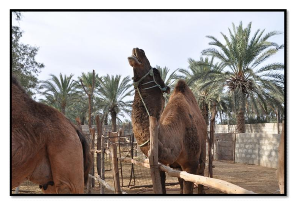
Figure 1. Dromedary camel flehmen: male dromedary camel usually show flehmen after sniffing dam's perineum.