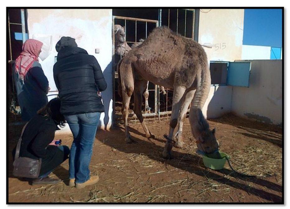
Figure 3. Recording of focal animal sampling ethogram of male camel sexual behavior during female passage: using "positive reinforcer" the female accept this procedure easily and she does not need any kind of restraint.