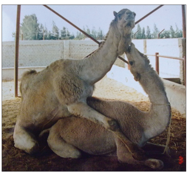
Fig 4. The male is trying to fix the forced female underneath.

In the small dromedary camel herds, the main cause of the noises heard at night is the sexual harassment of the deceived or forced females because of the unsatisfied male desire. Individual isolation of the male camels is necessary in case of small camel herds with a few female numbers. This would also help if the females were neither in heat nor pregnant. The receptive females should be taken individually to the male yard to enable peaceful mating. If the forced or deceived females were pregnant, the straining could lead to abortion. On the other hand, biting the knee joint could result in arthritis with its evil consequences.