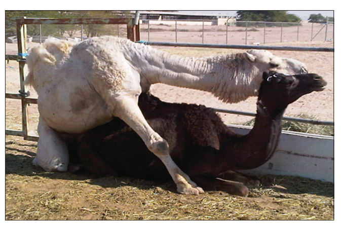
Fig 5. Focused male during mating of the receptive female (note the extended forelegs on the ground).