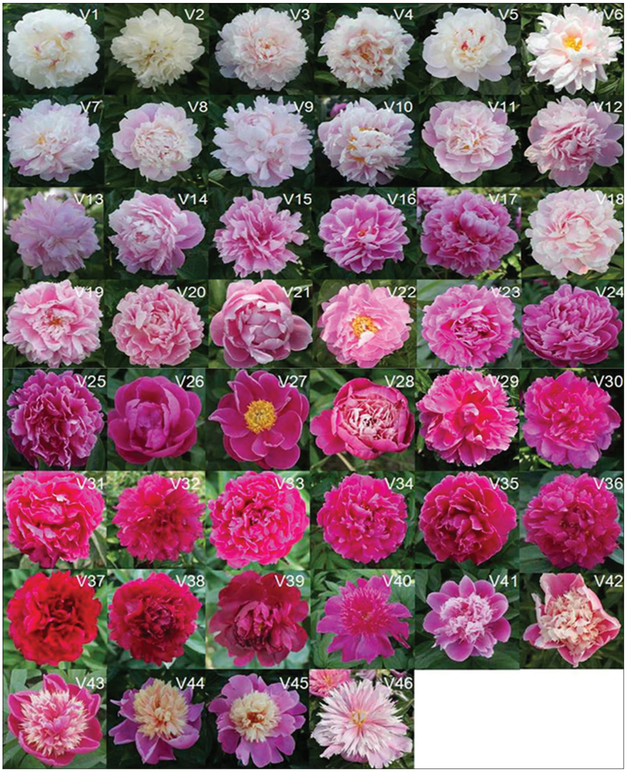
Fig 1. Flowers of 46 cultivars of P. lactiflora at full bloom stage.

Cultivars were ranged in order according to the color of flower petal from light to deep, with complex colors in the end. V1, 'Yulou Hongxing'; V2, 'Bingshan'; V3, 'Taohua Feixue'; V4, 'Zhushapan'; V5, 'Xishifen'; V6, 'Qili'; V7, 'Shengtaohua'; V8, 'Zhusha Dianyu'; V9, 'Fenpan Chengyan'; V10, 'Jingling Piaoxiang'; V11, 'Taohua Xijin'; V12, 'Fenlou Dianchun'; V13, 'Lanyu Huancui'; V14, 'Chenxi'; V15, 'Fenyinzhuang'; V16, 'Zilankui'; V17, 'Lanyu Jiaohui'; V18, 'Zhongshengfen'; V19, 'Taoli Yangzhuang'; 20, 'Ziyulian'; V21, 'Fenlanlou'; V22, 'Xixia Yinxue'; V23, 'Zhaoyuanhong'; V24, 'Hongyan Yushuang'; V25, 'Dadi Lushuang'; V26, 'Wulong Jisheng'; V27, 'Hongmanao'; V28, 'Dielian Qihua'; V29, 'Ziling Jinxing'; V30, 'Dafugui'; V31, 'Honglou'; V32, 'Niaochao'; V33, 'Hongyan Zhenghui'; V34, 'Zituo Ronghua'; V35, 'Huangguanfen'; V36, 'Honglou Piaoxiang'; V41, 'Zihong Jianrong'; V42, 'Huangxiuzhen'; V43, 'Jinlian Xianyu'; V44, 'Tailian'; V45, 'Zilou Xianjin'; V46, 'Zitan Xiangyu'.