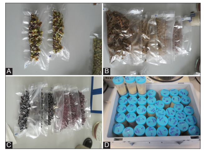
Fig 1. Grape bunch (A), stem (B), pomace (C) and laboratory samples (D) of grape by-products before analysisd.

Fig. 3 shows fibre fractions recalculated per kg of NDF. From this point of view, on the one hand, grape pomace in SK had the highest (p<0.01) L proportion (61.66%), but the lowest (p<0.01) ratio of C (28.78%) and H (9.56%). On the other hand, grape stem had the lowest L (45.36%; p<0.01) proportion. However, the grape stem had the highest (p<0.01) proportion of C (40.32%) and H (14.32%). In AT, the highest proportion of L (61.69%) and the lowest proportion of C (30.56%) was found in grape bunch. Similarly, the lowest H proportion (7.42%) was determined in the grape pomace. The same results