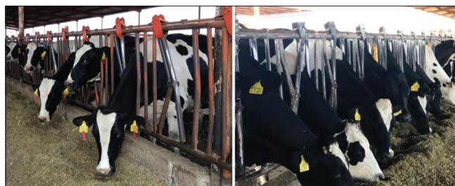
Fig 1. Cows with lactation length \geq 600 days enrolled in this. Cows on the left were milked two times a day; cows on the right were milked three times a day.

Herds were selected based on good milk and reproductive record-keeping (Afifarm; Kibbutz Afikim, Israel), high closeness between them (similar climatic conditions), fairly similar nutritional health and management programs (both herds belonged to the same company; Fig. 1). In one of the farms, cows were subjected to two-times-a-day milking (2x) whereas in the other farm cows were milked