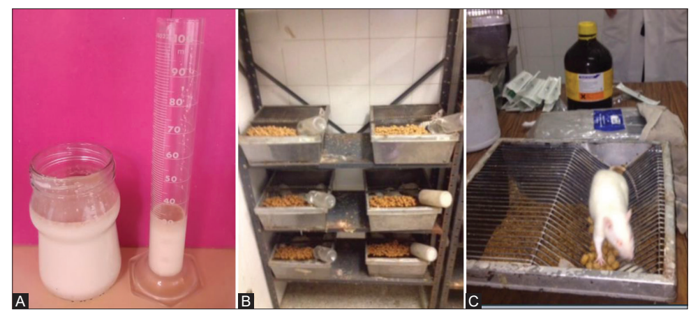
Fig 2. Images collected during the study. A) Canary seed infusion obtained from cereal. B) Organization of the rats for the experimental design and C) Sprague Dawley rats before sampling.

diet, but five mice received the infusion of birdseed, and the others were given only water. The other group received a diet change to norm caloric (DHC-N), but five mice received the birdseed infusion and the other water. The birdseed infusion was provided Add libitum for 45 days (figure 2-B). These three probable conditions were proposed to know the effect of the infusion consumption on three possible scenarios, healthy individuals (DNCs), individuals with dyslipidemias without dietary change (DHC) and dyslipidemia and diet change (DHC-N). The experimental scheme is shown in the following diagram.