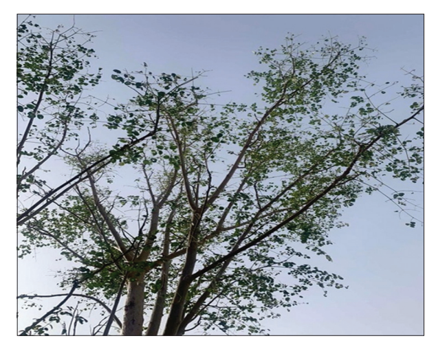
Fig 1. Moringa oleifera tree growth in Al-Ahsa oasis in Saudi Arabia.

Fresh MO leaves (500 g) were harvested and collected manually from fully ripe trees randomly selected during the year 2019 from the local Al-Ahasa farm in Saudi Arabia (Fig. 1). The MO leaves were cleaned thoroughly to remove extraneous dirt and washed under running tap water then rinsed with distilled water to dry in air dryer at room temperature (25°C) for 24 hours before being ground into a powder (the whole MO powder (WMOP) were added to chicken burger). Aliquots (100 g) of powder was mixed in 80 % (v/v) methanol and the mixture was shaken (100 rpm) using a shaker for 10 min and finally centrifuges at 3000x rpm for 10 min, this step was done three times and the supernatants were collected. The combined of were concentrated by in a rotary evaporator (IKA RV 10 Control, Werke GmbH and Co. KG, Germany) at 40 °C with a vacuum pump and the extracts were freeze-dried (used it as MO polyphenol extract (MOPE) in chicken burger). The dried extracts were dissolved in