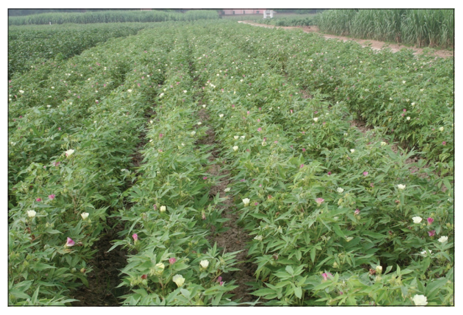
Fig 3. A field view of the crop during peak bloom stage.

Analysis of variance has been carried using SAS software 9.4 (SAS, 2017 Institute, Cary, NC,US) separately for