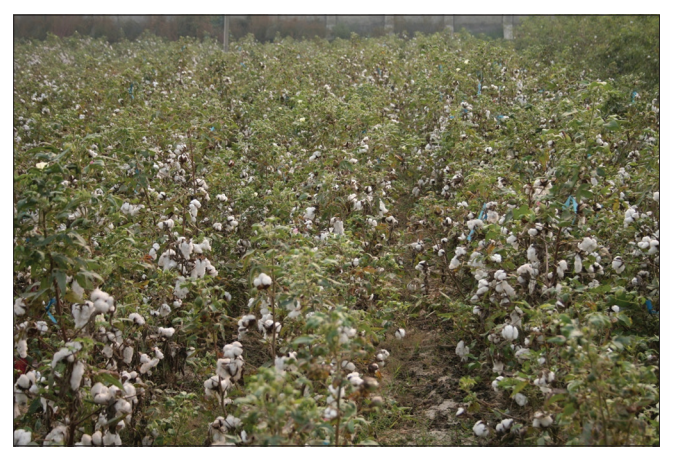
Fig 4. A field view of the crop during boll opening period.

individual seasons/environment and owing to similar trend of results for both study years, data has been pooled by keeping seasons/environment as a main plot factor to enhance the precision for drip irrigation and nitrogen fertigation. Fisher's LSD (p=0.05) has been employed to compare the difference among means.