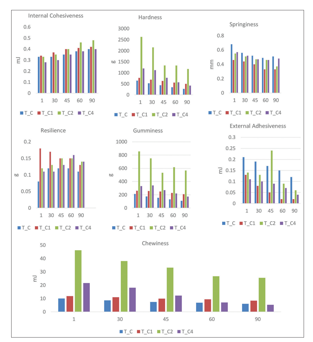
Fig 2. Comparison of changes in textural parameters of Tulum cheese during ripening period

The textural analysis results are presented in Fig. 2. In terms of hardness, the lowest and highest scores were