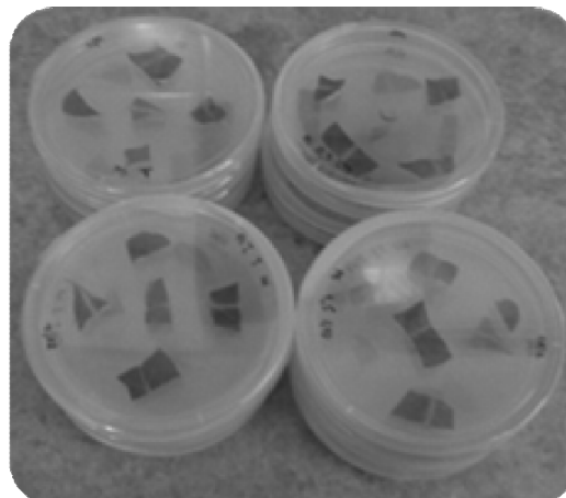
Figure 2. Foliar Sections of Phytolacca tetramera in induction medium.