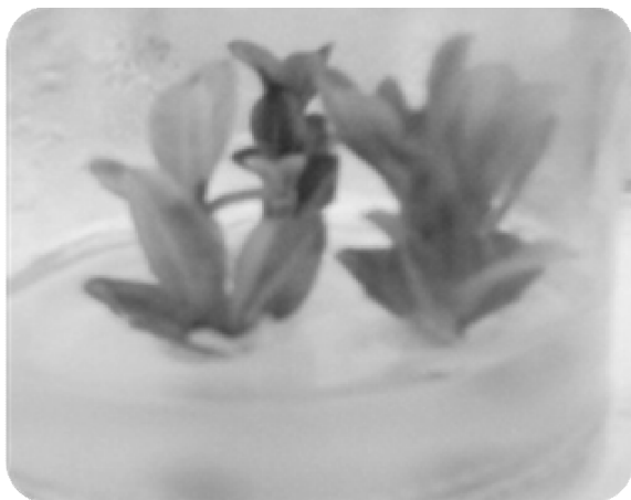
Figure 1. Phytolacca tetramera in vitro.

The callus formed on the edges of the explant were disintegrable, and they could be observed in different stages of somatic embryos (globular and torpedo).